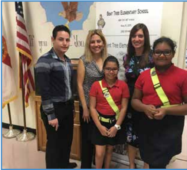
Community Internship Experience

Representative. I learned how to read House and Senate bills. I also learned how to research news on the Internet, scan business cards, and transfer them to a database.