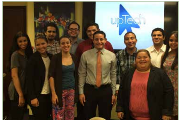
First cohort of students participating in the Honors College upTech Program

I am introduced to activities at FIU through my peer coach. She