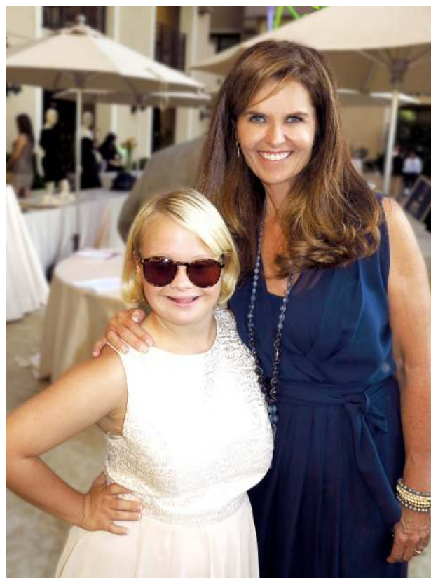
Lauren Potter, Glee Actress and Maria Shriver, Journalist, Author & Activist.

Another great option to help your child find a job is Best Buddies. Unlike other organizations, your child can become involved in Best Buddies starting in middle school. The goal of this organization is to pair an individual with disabilities with a peer who does not have disabilities. As your child moves on to high school and college, he or she can continue to grow with Best Buddies. Overall, Best Buddies offers eight programs to help your child at each stage of their development: middle schools, high schools, colleges, promoters, citizens, ambassadors, jobs, and e-Buddies. By becoming involved in Best Buddies, your child can gain social skills from and develop friendships with peers who do not have disabilities.